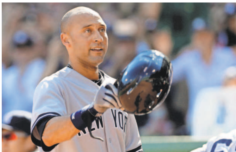
Derek Jeter will be joined by Larry Walker in the 2020 Baseball Hall of Fame class.

Ken Griffey Jr., who was three votes shy of being a unanimous selection in