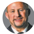
Bob Nightengale Columnist USA TODAY

OK, so who's going to step up and be the whistle-blower in baseball's latest controversy?